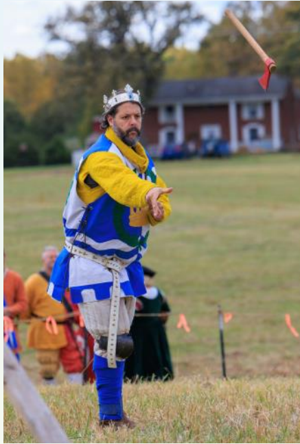
King Abran de la Barra