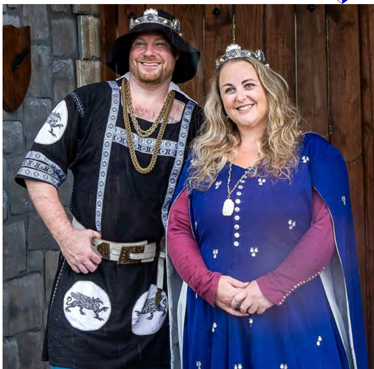
Prince Athos and Princess Alianora — 3 May 2025