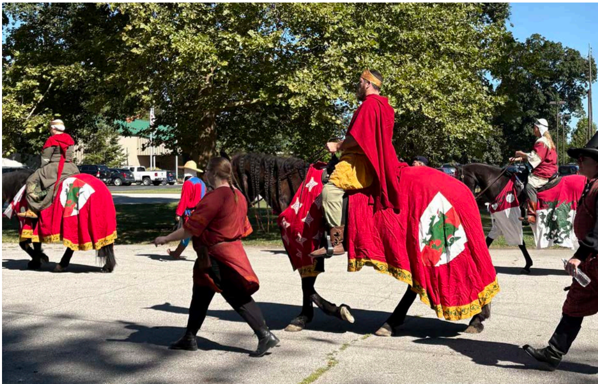
Royalty on parade at Mounted War Games. This is the largest equestrian event in the Middle Kingdom, and one of the largest in the Known World.