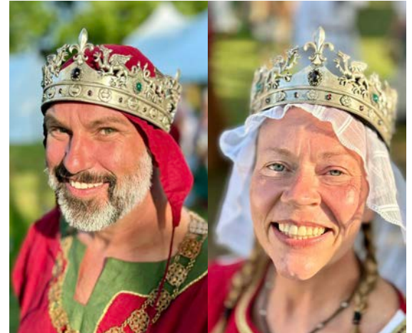
The Prince and Princess, as They were at Pennsic.

Please see an updated version of Their missive regarding Crown Tourney in this month's issue of Beyond the Pale.