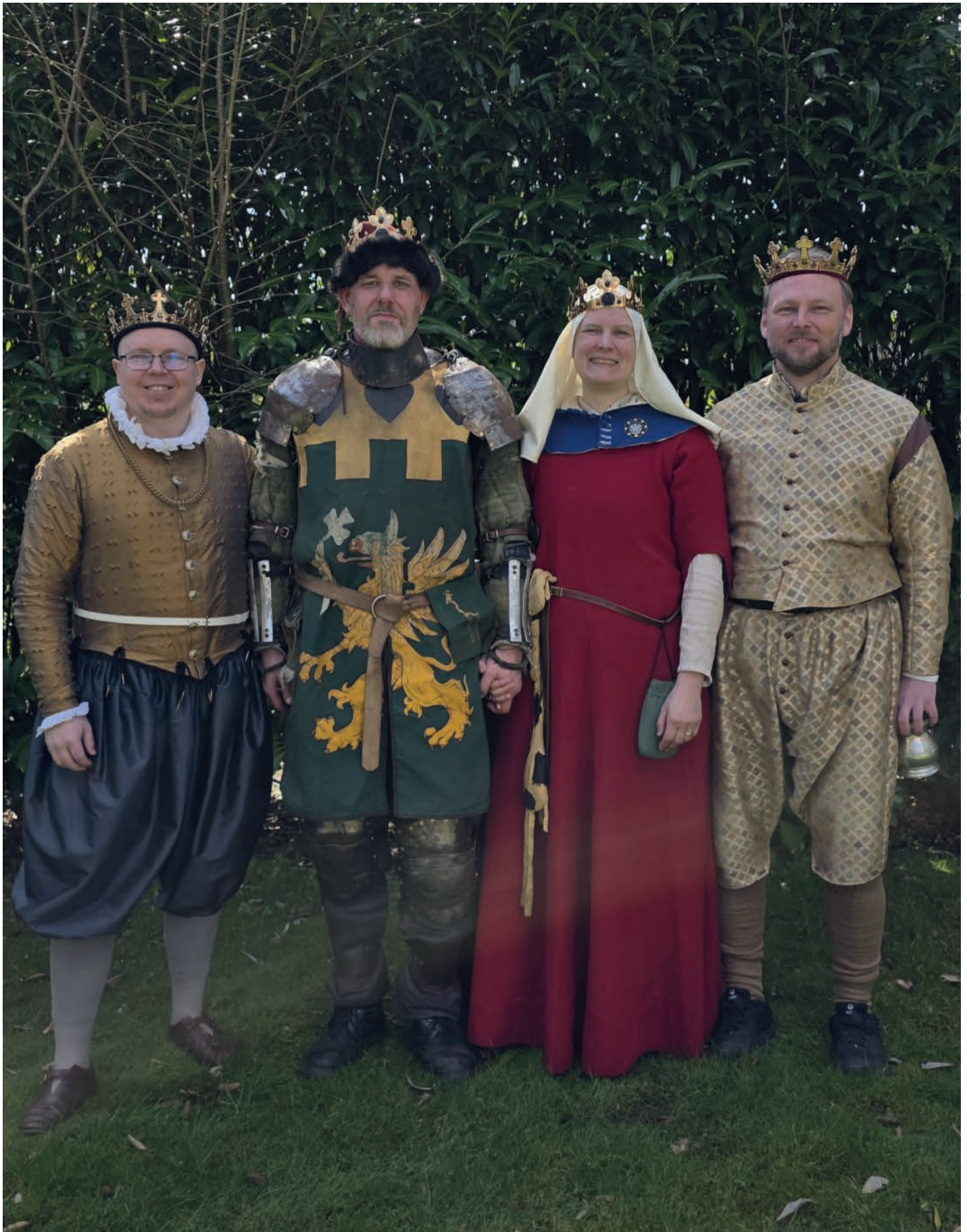
Their Royal Majesties and the Heirs to the Drachenwald throne