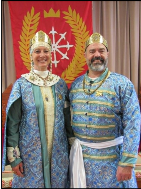
king@aethelmearc.org - queen@aethelmearc.org