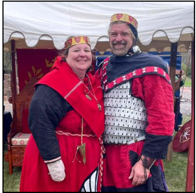
prince@aethelmearc.org - princess@aethelmearc.org