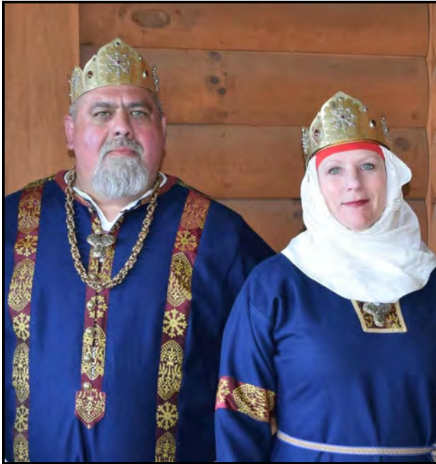
king@aethelmearc.org - queen@aethelmearc.org