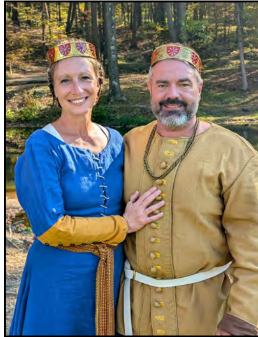
prince@aethelmearc.org - princess@aethelmearc.org