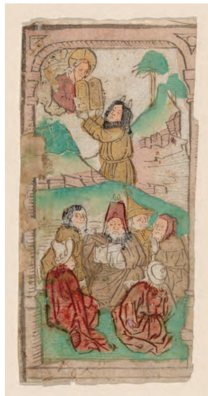
MOSES RECEIVING THE LAW, ILLUSTRATION FROM A "BIBLIA PAUPERUM," NETHERLANDS, CA. 1465 CE. MET MUSEUM (NY)

V-3440 --- The Rebated Steel Marshal is a Lesser Officer to the Earl Marshal and will promote the safe and orderly conduct of rebated steel activities.