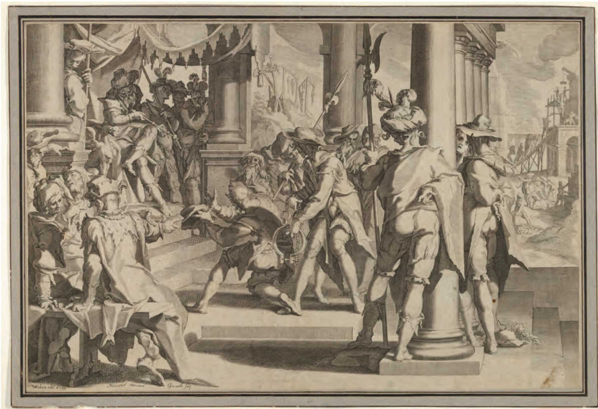
ALLEGORY OF JUSTICE (SANCTITY OF THE LAW) WITH A COURT SCENE DEPICTING A MAN BEING PARDONED BY A JUDGE, PLATE XII FROM "THRONUS JUSTITIAE, TREDECIM PULCHERRIMUS TABULIS..." BY WILLEM VAN SWANENBURG, NETHERLANDS, 1605 CE.