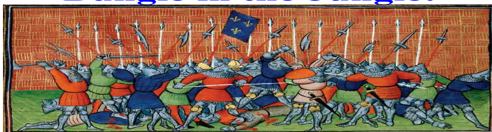
Starhaven's annual day of melee fun and classes.

The festivities shall be hosted at Wickham Park 2500 Pkwy Dr. Melbourne, FL 32935 at Pavilions # 4 & 5 on Saturday November 29th, 2025 from 9 AM - 7 PM