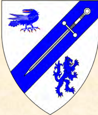
AIDEN AP GRENDAI KING OF AVACAL