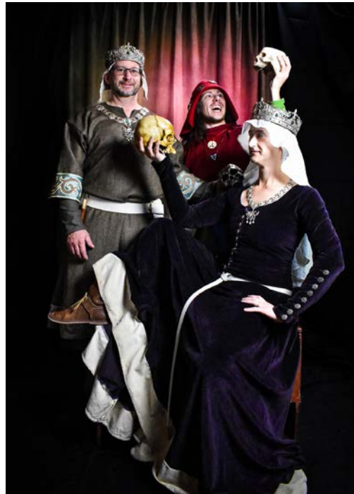
Prince Louis, Princess Sadb, and Bird the Bard are up to something at Christmas Tourney.

Louis and Sadb Highnesses of the Middle Kingdom