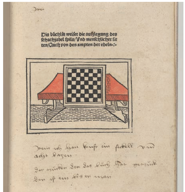
THE BOOK OF CHESS. AUTHOR JACOBUS DE CESSOLIS (ITALIAN). PUBLISHER HEINRICH KNOBLOCHTZER (GERMAN).

Do you have a medieval problem or quandary? Send your message to northwatch@northshield.org and include "Dear Abbess" in the subject line to get some expert advice.