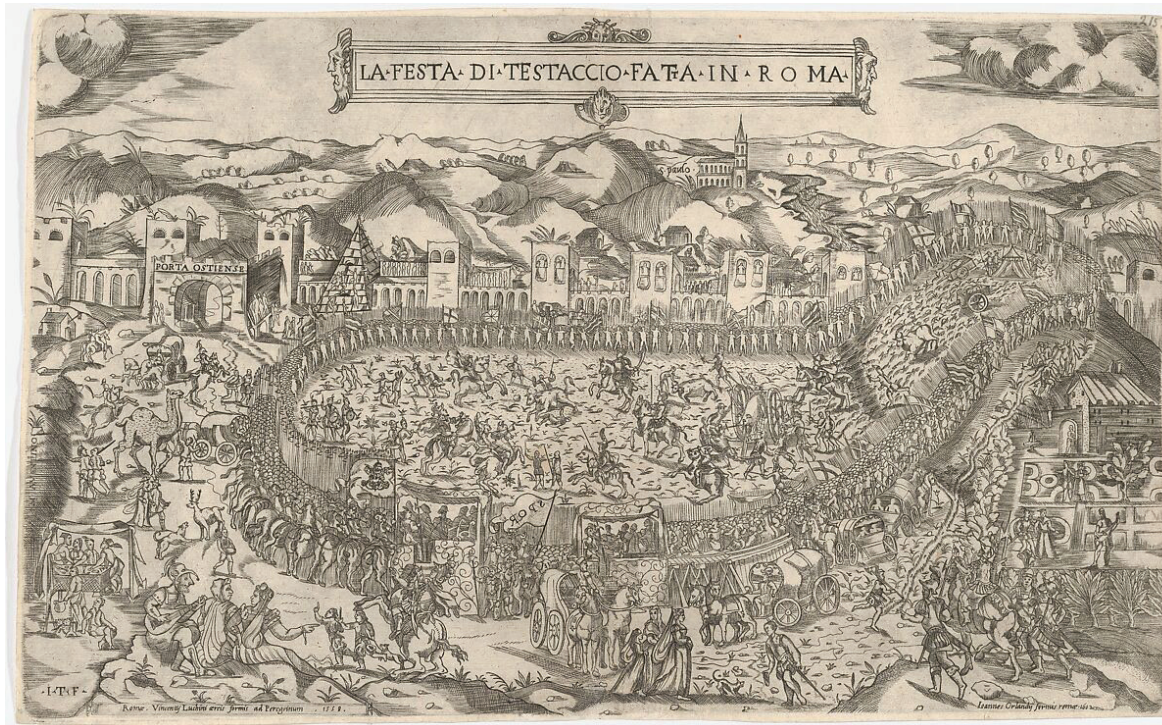
CARNIVAL GAMES HELD ON MOUNT TESTACCIO IN ROME. PUBLISHERS: VINCENZO LUCHINO AND GIOVANNI ORLANDI. ENGRAVING. ITALY. CA 1540-60 MET MUSEUM (NY)