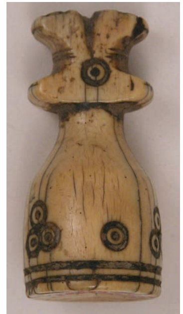
CHess PIECE, ROOK. ATTRIBUTED TO WESTERN ISLAMIC LANDS. 8-10TH CENTURY.