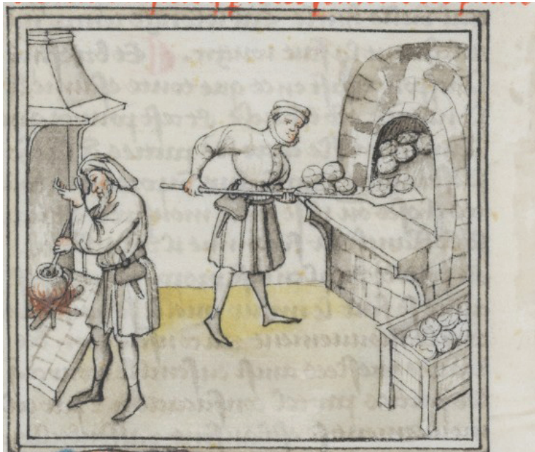
A MEDIEVAL BAKERY, FROM THE BOOK OF PROBLEMS OF PSEUDO-ARISTOTLE, TRANSLATED INTO THE FRENCH BY ÉVRART DE CONTY. CA. 1400.

with the KA&S Chancellor on an annual basis. See also: V-3600 --- Chancellor of the Kingdom Arts and Sciences Faire of Northshield