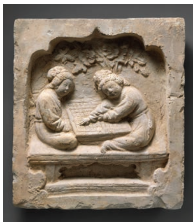
LEFT: TILE WITH WOMEN PLAYING A BOARD GAME. CHINA. 13TH CENTURY.

A correction to the previously published Court Reports in the January 2026 issue of the Northwatch . The event held on November 8, 2025, should have read Tournament of Chivalry and not Tournament of Champions .