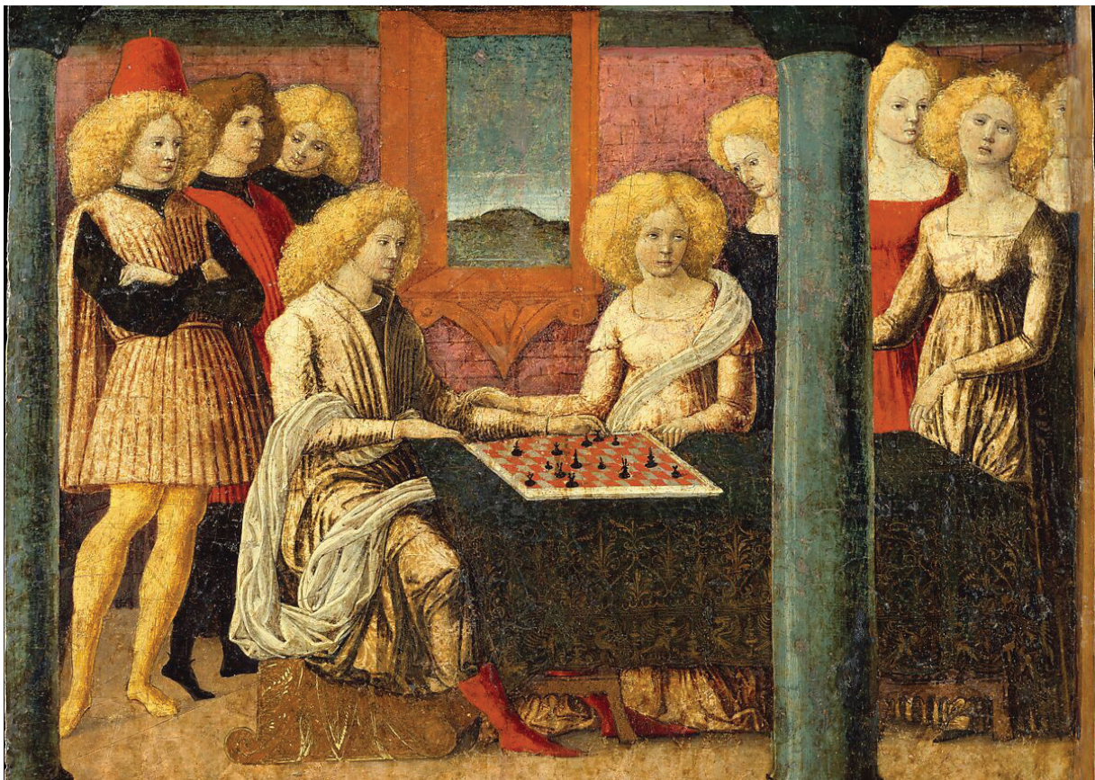
THE CHESS PLAYERS. LIBERALE DA VERONA, ITALIAN. CA. 1475. THE MET MUSEUM (NEW YORK)