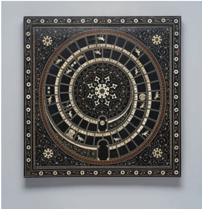
CHESSE AND GOOSE GAME BOARD. INDIAN, GUJARAT. LATE 16TH CENTURY. MET MUSEUM (NY)