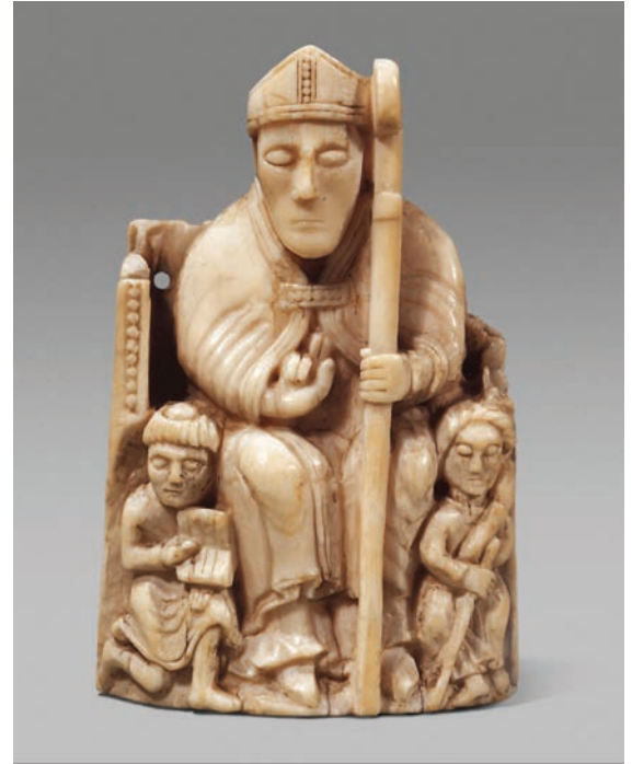
BISHOP CHESSE PIECE. SCANDANAVIAN. LIKELY NORWAY. CA. 1150-1200 MET MUSEUM (NY)

Help us spread the word! Please feel free to share this announcement with your local branches and guilds.