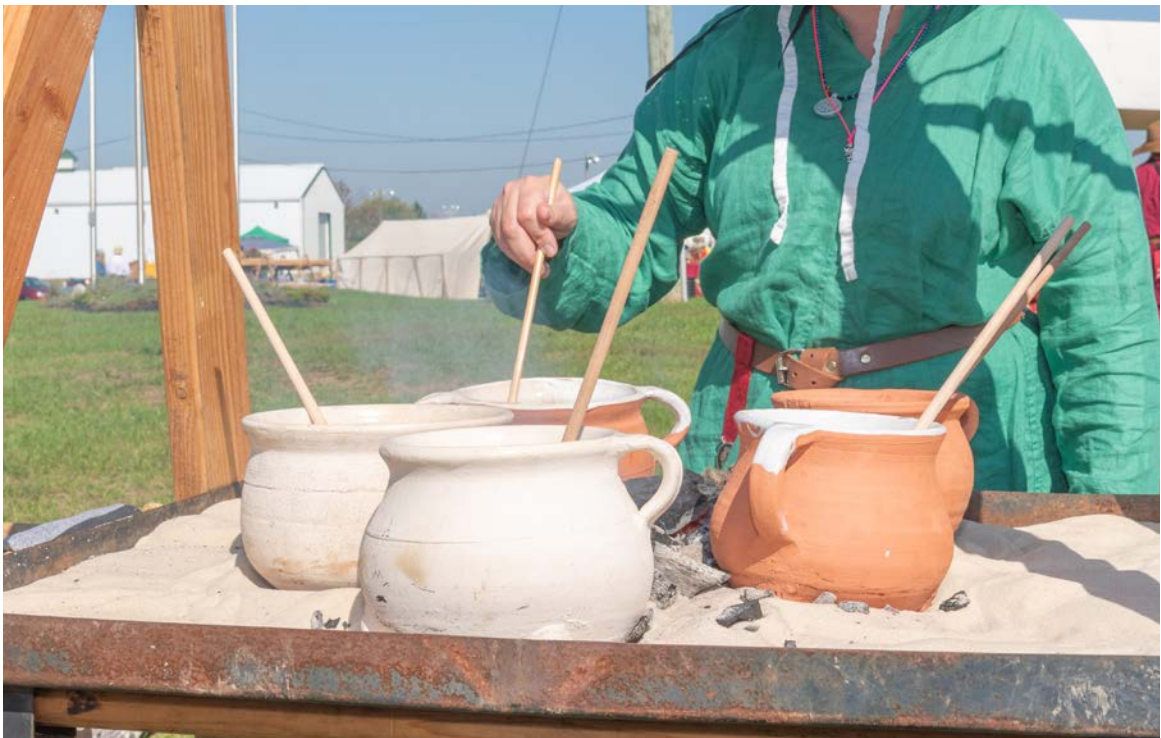
Stirring the pot at Red Dragon.