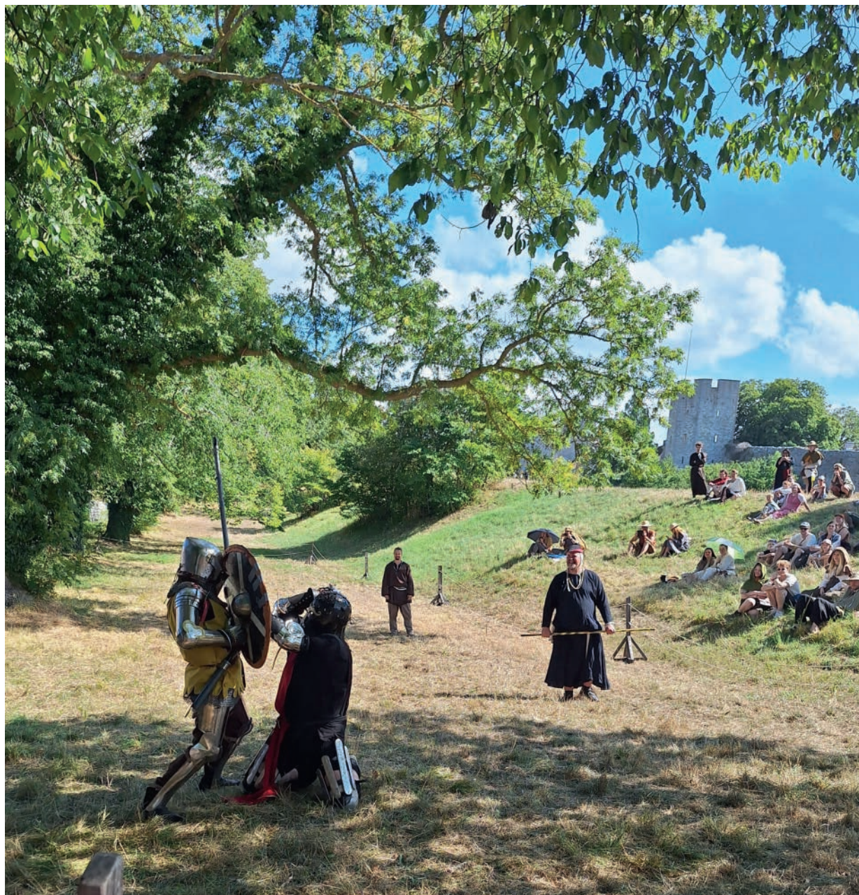
Unbelted Tourney at Medieval Week in Visby

Official Newsletter of the Kingdom of Drachenwald