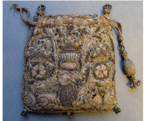
Silk bag with gold thread and metal spangles. The embroidery depicts a lion, a lamb, snails, crowns, and roses. Made in England in the 17th century and part of the collection at the British Museum.

Linen bag with silk and silver thread embroidery. Depicting flowers, birds, and other shapes, with elaborate tassels. English, from the early 1600s, and part of the collection at the Cleveland Museum of Art.