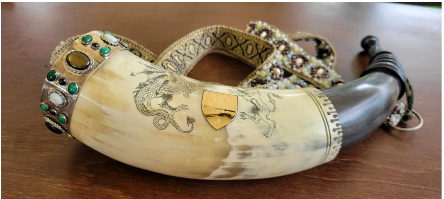
The Pennsic War Horn.

The Barony of Roaring Wastes in the region of Pentamere is preparing to conduct a poll in order to provide counsel to the Crown regarding Their choice for the next Coronets. Polls will be available through the Barony's website for both residents and non-residents