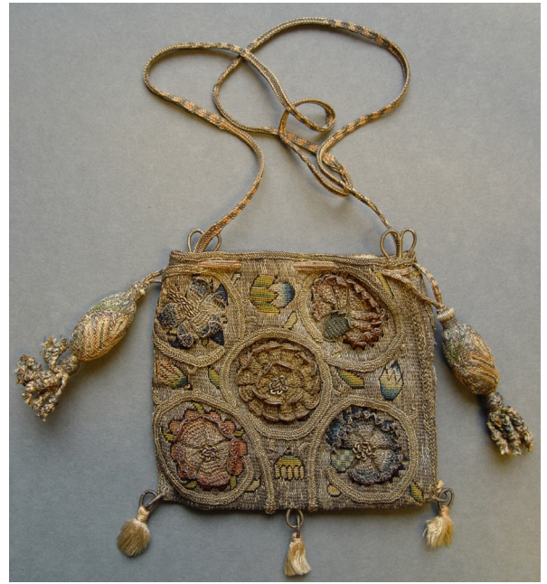
A woven silk sweet bag with metal thread. The five flowers pictured are borage, carnation, marigold, rose, and cornflower. Made in England in the 16th-17th century and part of the collection at the British Museum.

The image of the linen bag with embroidered birds and other shapes is courtesy of the Cleveland Museum of Art. As of January 23, 2019, the Cleveland Museum of Art is an Open Access institution, using the Creative Commons Zero (CC0) designation for high-resolution images and data related to its collection.