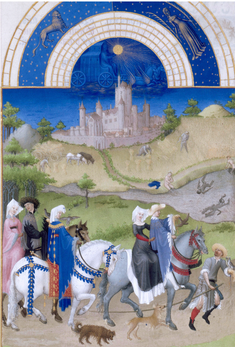
AUGUST FROM THE TRÈS RICHES HEURES DU DUC DE BERRY , BY THE LIMBOURG BROTHERS, FRANCE, 1412-16 CE

Do you have a medieval problem or quandary? Send your message to northwatch@northshield.org and include "Dear Abbess" in the subject line to get some expert advice.