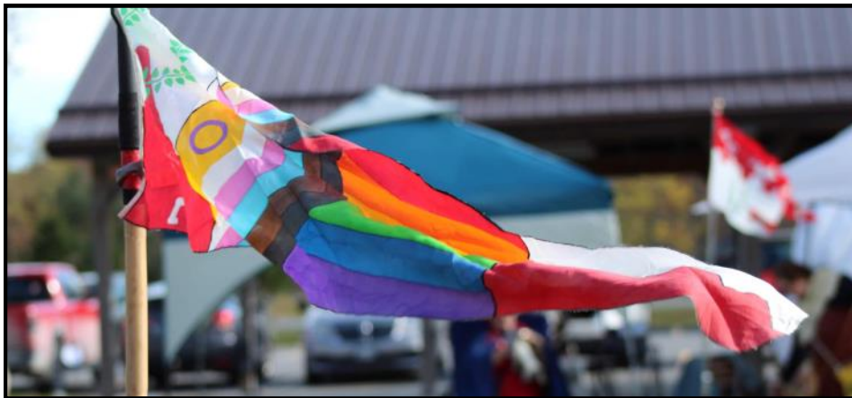
Photo of Barony of Skrealing Althing's pride flag