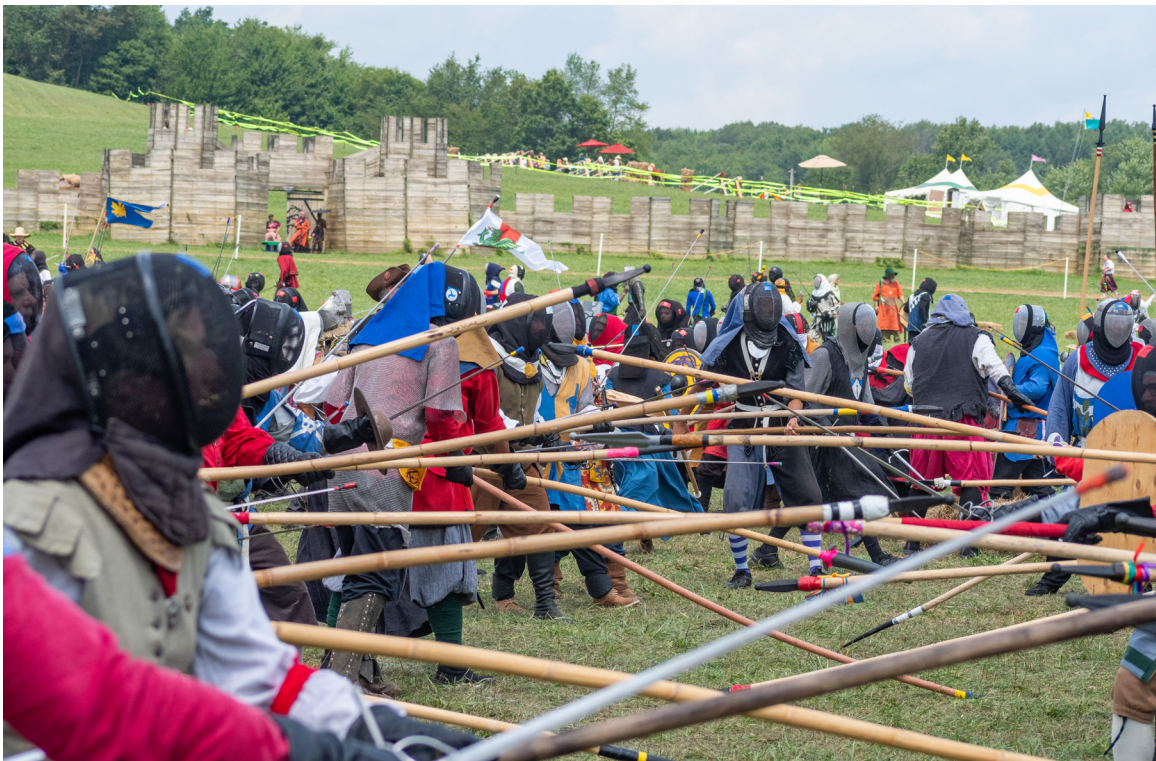
Rapier combatants battle with spears at Pennsic 51.