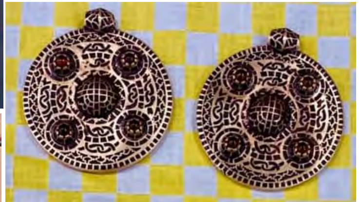
A FEW OF THE WINNING ENTRIES FROM PREVIOUS DELIGHTFUL DUO CONTESTS