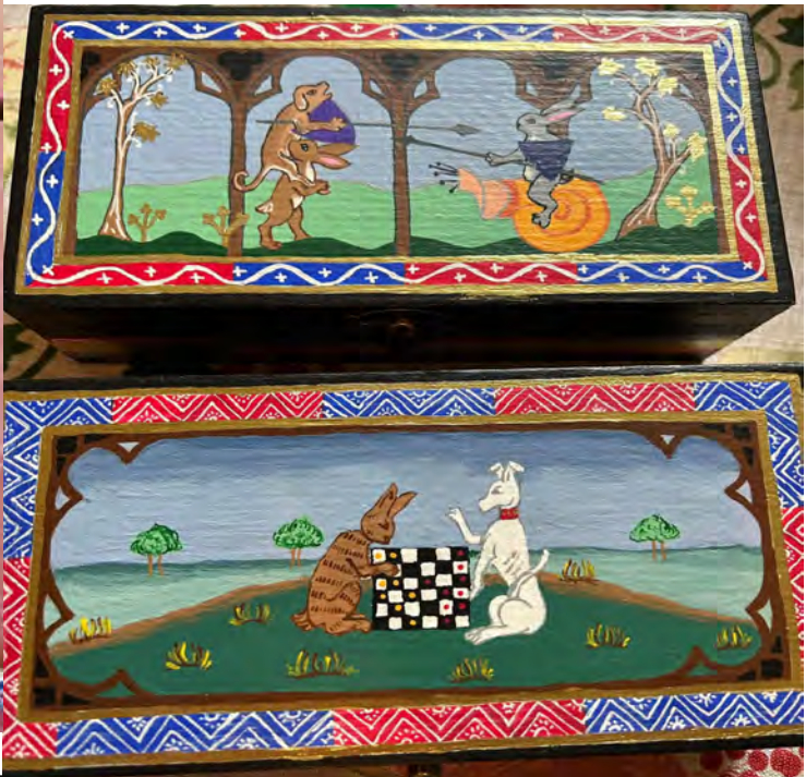
All images of past winning entries on this page are by Sibylla de Waryn