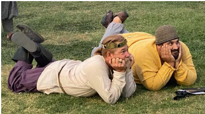
Photo Credit: "Court" by Mistress Magdalen Venturosa OP (Monique Berry Lyon)