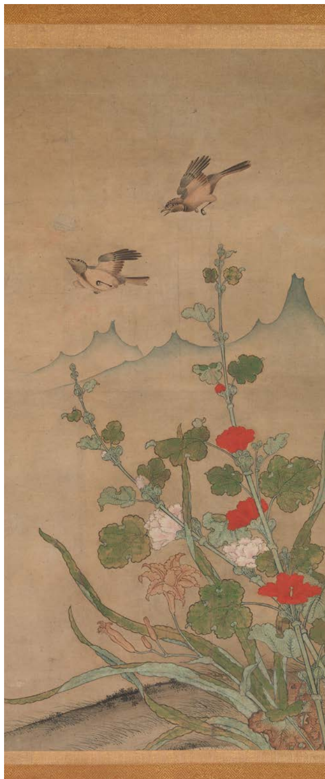
BIRDS AND FLOWERS OF SUMMER (HALF OF A SET, WITH BIRDS AND FLOWERS OF AUTUMN) BY SHIKIBU TERUTADA, JAPAN, MID-16TH C. CE MET MUSEUM (NY)