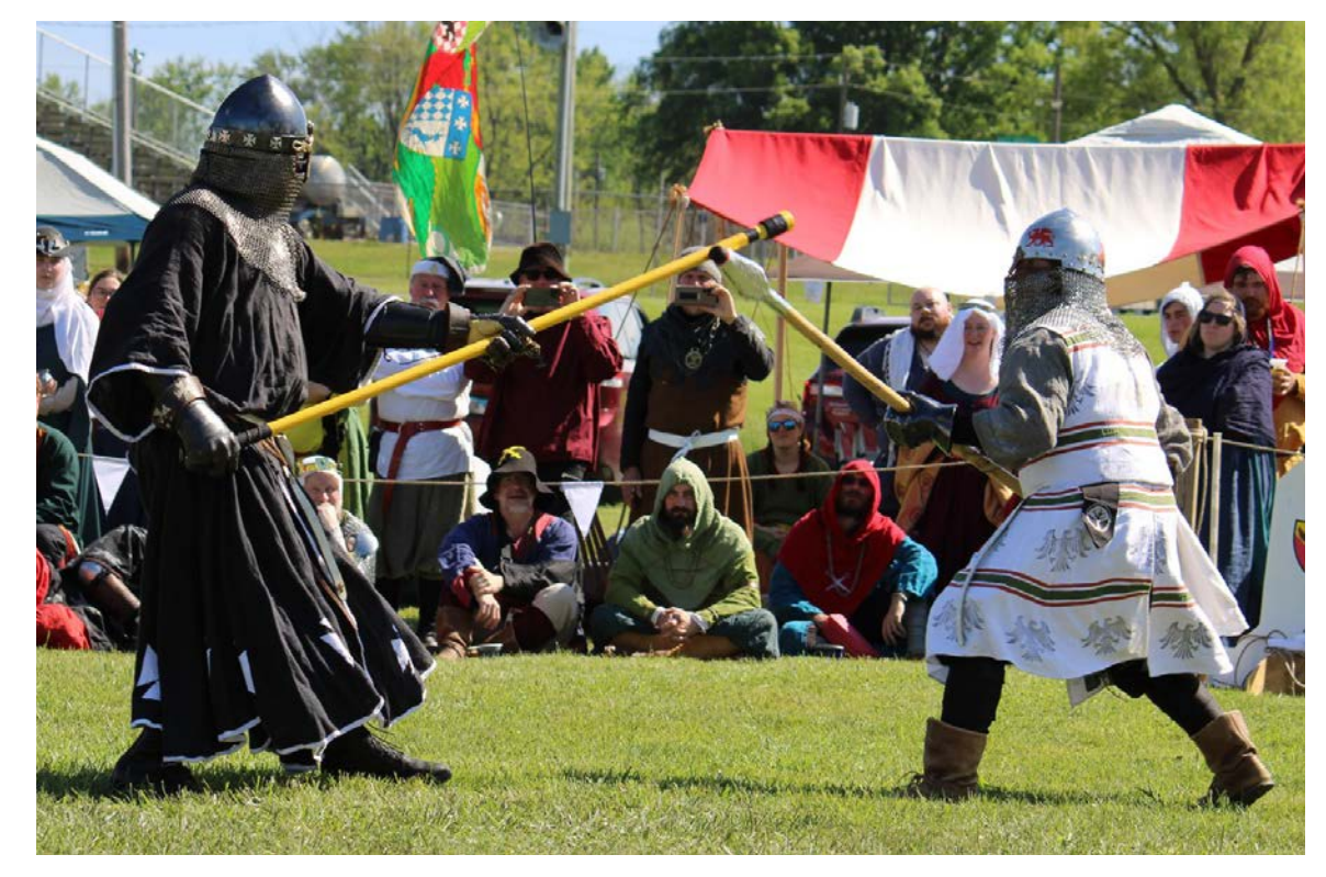
Finals of Spring Crown Tourney 2025 fought between Count Louis and Sir Sascha.