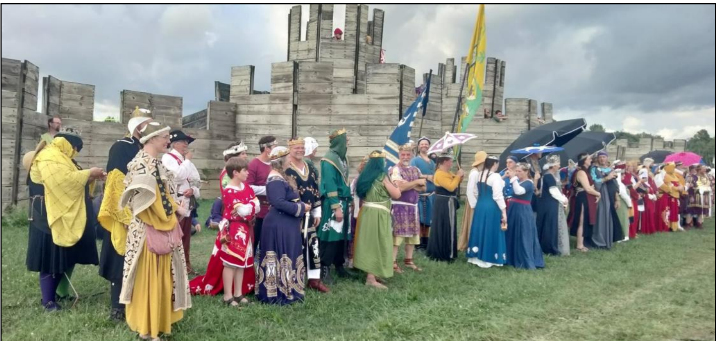
Opening Ceremonies Pennsic War 51.