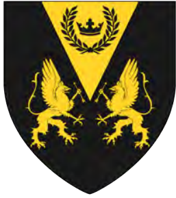
Shire of River Serpent