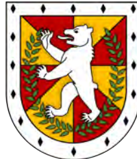
Shire of Cote du Ciel