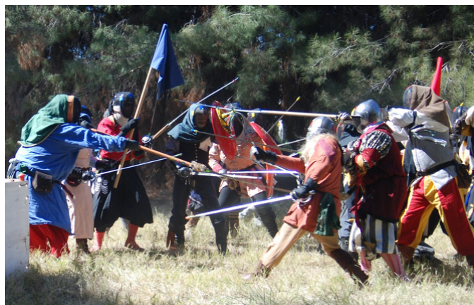
Photo Credit: "Estrella Woods Melee" by Lion Ari Usni, OL OP (Jocelyn Frazier)

Go east on I-10 and exit at Route 83 (scenic highway), Proceed south on Route 83 approximately 18 miles to the paved road on your left between mile post 40 and 39. Watch for brown Historic Empire Ranch sign on the right side of the highway. Turn east (left) onto paved road and follow for 3 miles to the Empire Ranch House on your left. Follow the SCA white signs to the campgrounds.