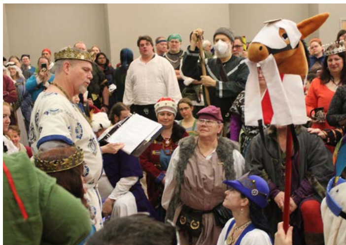
Royal Court at Festival of Maidens, with King Kilian and Baroness Gwendolyn of Shadowed Stars.

If you are interested in this position, please submit your SCA resume and letter of intent to herald@midrealm.org and clerkop@midrealm.org no later than February 28, 2025.