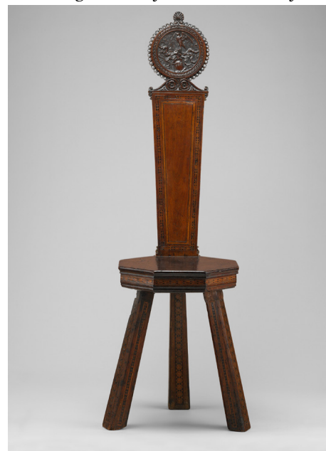
CHAIR, c. 1489-91 CE, FLORENCE