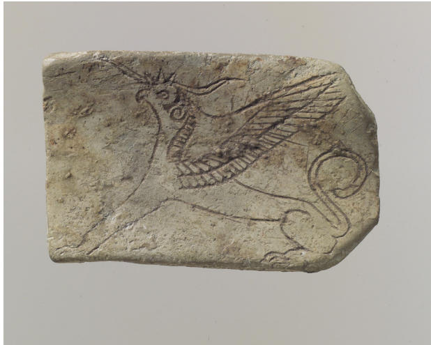
FURNITURE PLAQUE BEARING AN INCISED GRIFFIN, 18TH C. BCE, ANATOLIA