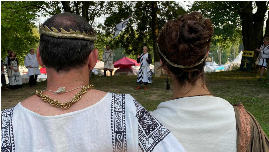
Their Majesties in dragon tail crowns at Pennsic 50