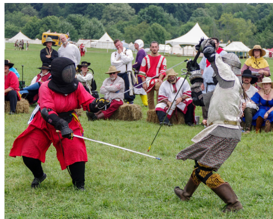
Two rapier combatants at the Pennsic 50 Champions Battles.