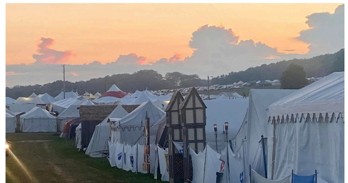
Sun and haze over Pennsic -.