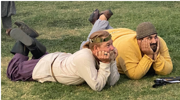
Photo Credit: "Court" by Mistress Magdalen Venturosa OP (Monique Berry Lyon)