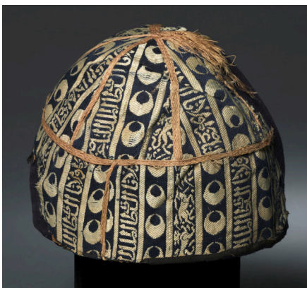
Pictured, left: A 14th-century cap with striped inscribed silk from the Mamluk Sultanate (Egypt or Syria).

The Africa & Byzantium exhibition is in Cleveland 4/14/24-7/21/24, following its debut at the Metropolitan Museum of Art. The exhibit was organized by The Met and the CMA.