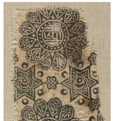
Pictured, right: A fragment of a woodblock print on linen, also from the Mamluk Sultanate. 13th or 14th century.

These images are courtesy of the Cleveland Museum of Art. As of January 23, 2019, the Cleveland Museum of Art is an Open Access institution, using the Creative Commons Zero (CC0) designation for high-resolution images and data related to its collection.