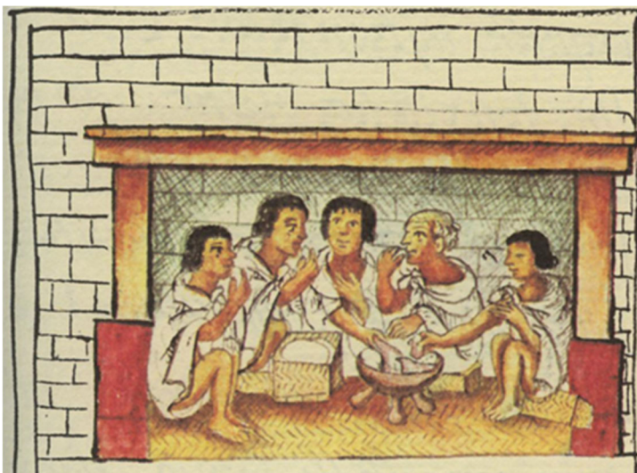
Aztec men sharing a meal. Florentine Codex, late 16th century. Wiki Commons.

Menus". The next five chapters are on the Maya. The first titled "The Maya and the explorers" discusses the differences the Europeans encountered between the Aztecs and the Mayan. The next chapter is titled "Diego de Landa" the problematic Franciscan who Coe describes as a "two Faced figure". The third chapter on the Maya is titled and speaks to "Solid Maya Breadstuffs" including tortillas, tamales, etc. The chapter titled "Maya Flesh Food" discusses the "meat, fish (and) fowl that Coe refers to as "flesh" through the rest of the chapter and their preparation and nourishment and status. The final Maya chapter is dedicated to "Maya Produce". These five chapters hint at recipes we might be able to recre-