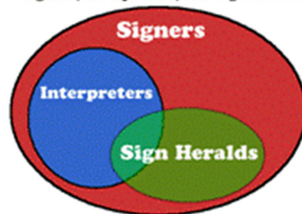
The relationships between Signers, Interpreters, and Sign Heralds