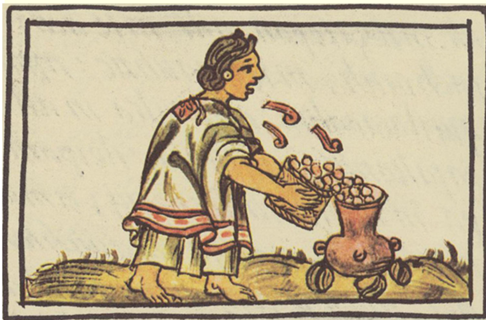
An Aztec woman blowing on maize before putting it in the cooking pot, so that it will not "fear the fire" since it is considered a god. Florentine Codex, late 16th century.

"Eat this book" is a column produced for An Tir's Kingdom newsletter, The Crier. I hope to help you build your food history library. If you have a comment, book, country, or a time period you would like explored please write to me at: info@vastrepast.com