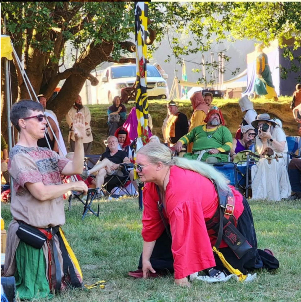
Sign Herald (left) lip-reading and signing from prompts from the gentleperson in red (right)