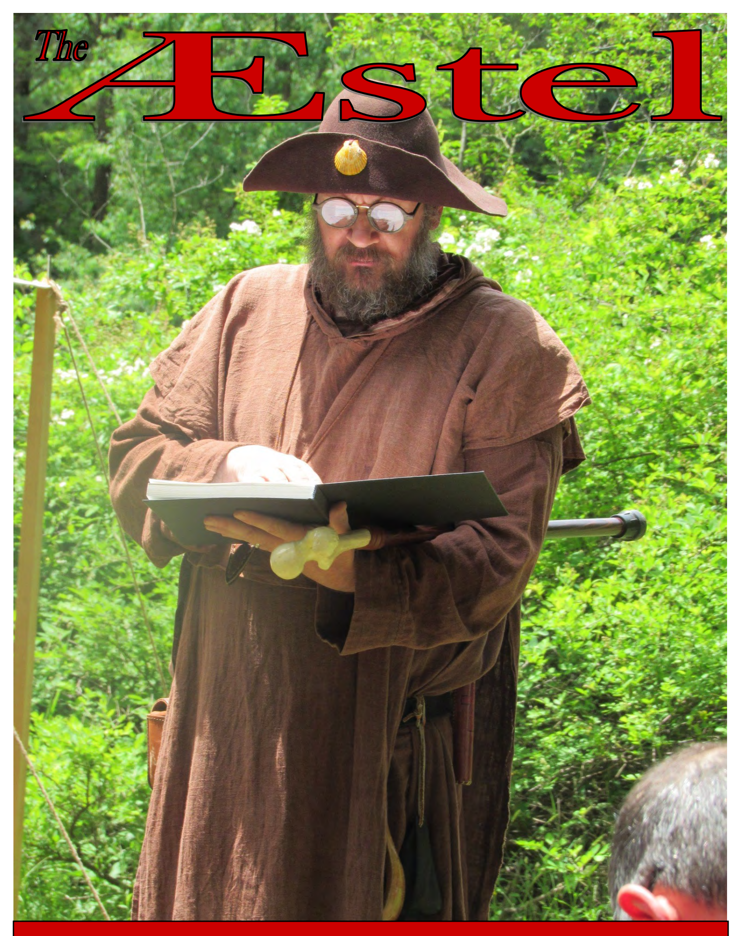
The Newsletter of the Kingdom of Æthelmearc May 2025 A.S. LIX