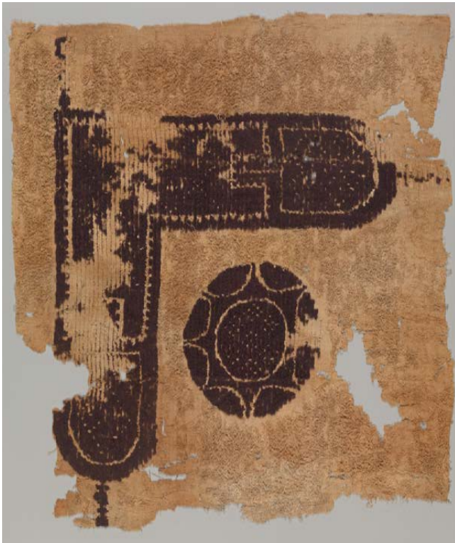
TEXTILE FRAGMENT WITH LOOPED EMBROIDERY (BELOW), EGYPT, 3RD-4TH C. CE MET MUSEUM (NY)

Do you have a medieval problem or quandary? Send your message to northwatch@northshield.org and include "Dear Abbess" in the subject line to get some expert advice.