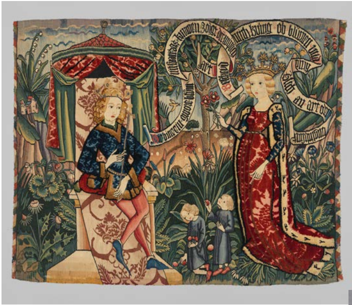
TAPESTRY DEPICTING TWO RIDDLES OF THE QUEEN OF SHEBA, GERMANY, CA. 1490-1500 CE MET MUSEUM (NY)