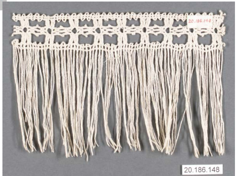
BOBBIN LACE EDGING, ITALY, 16TH C. CE MET MUSEUM (NY)