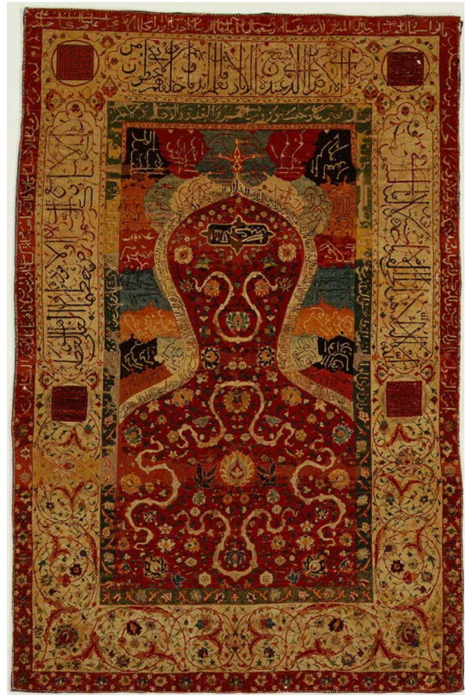
SAJJADAH (PRAYER RUG), IRAN, 16TH C. CE