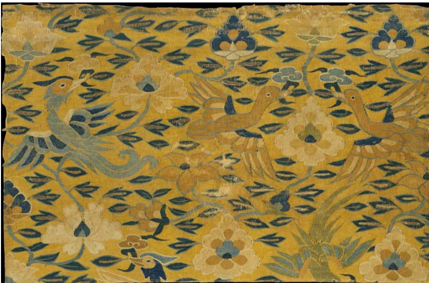
TAPESTRY SCROLL COVER WITH BIRDS & FLOWERS, CHINA, 12TH C. CE MET MUSEUM (NY)