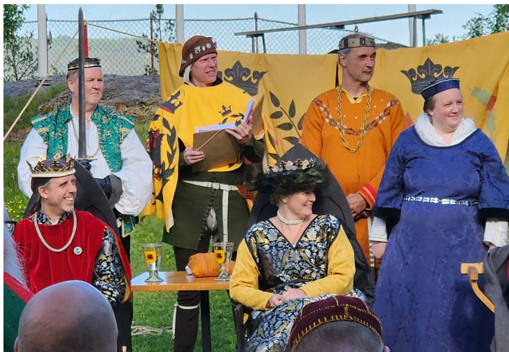
Drachenwald's court

There are a few things that one must do differently when attending an event in a foreign country that one may not readily think about. It seemed fair to provide a few tips and tricks to help others overcome some stressful situations.