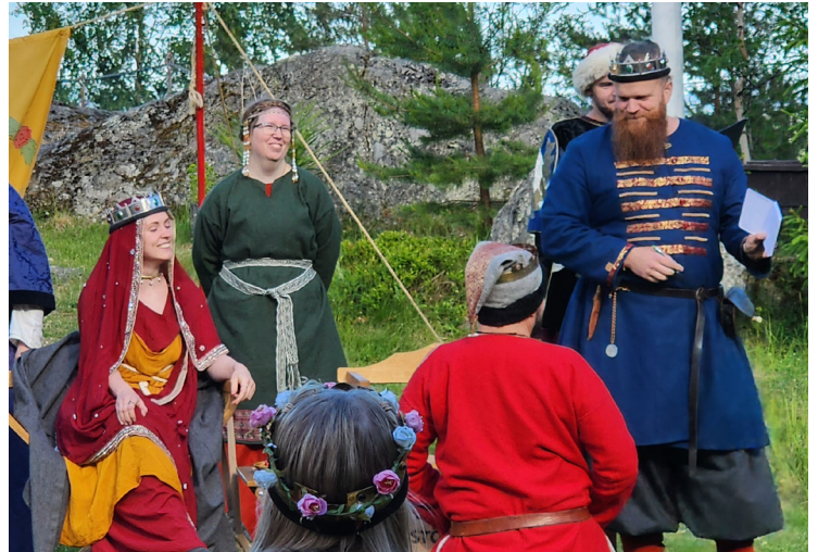
Drachenwald's Midsummer Coronation -.

that I am, I hoped I would be able to attend them to learn how their processes worked. I asked the Event Steward what the protocol was, and she sent me to the Royalty Liaison. She was an absolute delight who walked me through cultural differences, and encouraged me to attend for an interkingdom exchange of ideas. Continued next page.