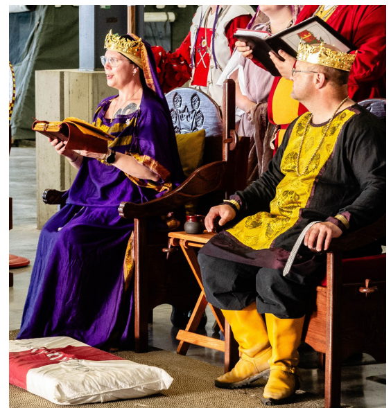
Their Majesties in Court at Spring Crown Tourney.