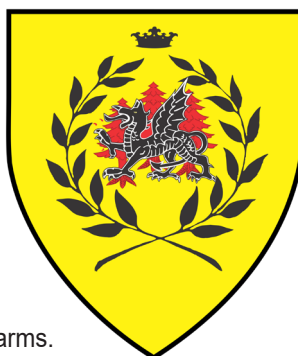
Drachenwald's coat of arms.