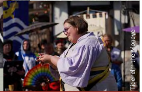
Tidehelm the Moneyer