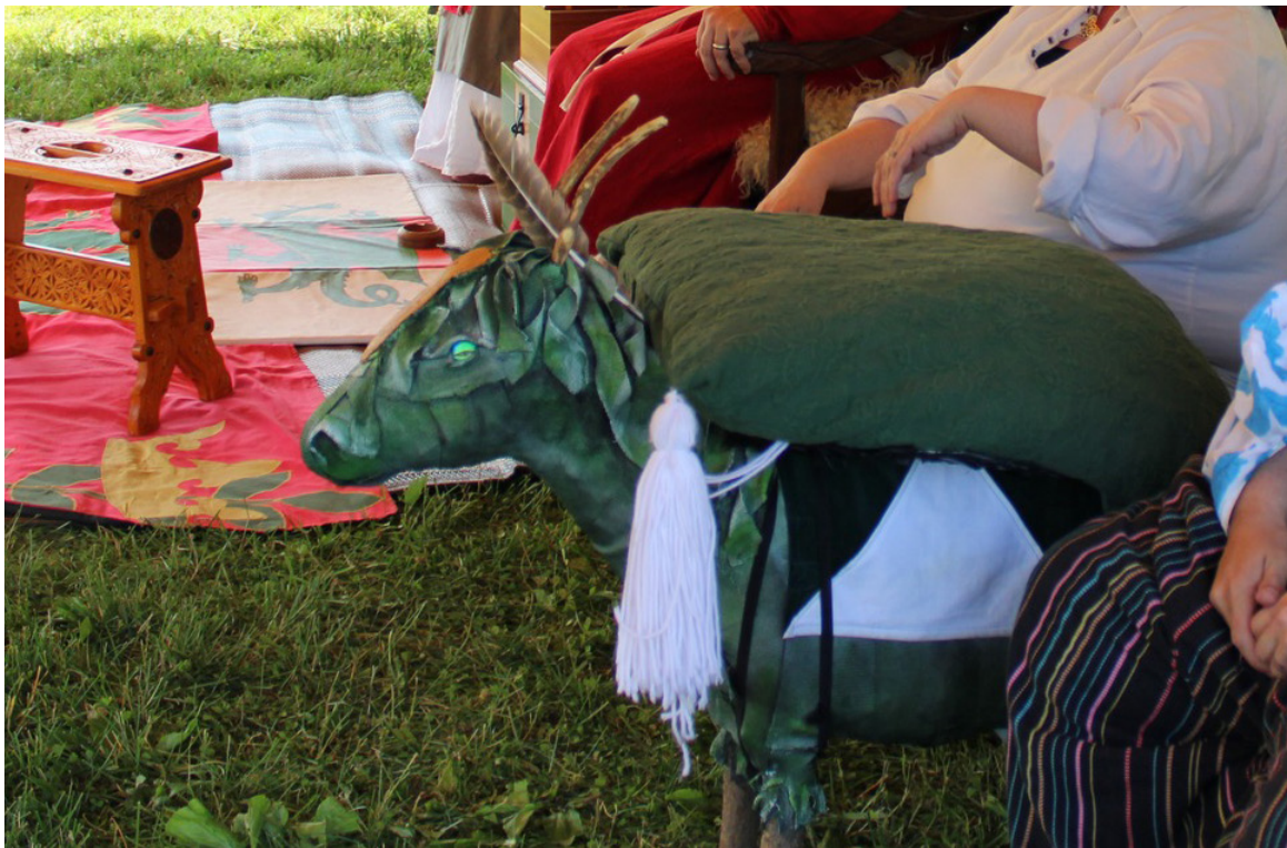
A picture tells a story - perhaps someone will share the tale of this green goat in court at Ragnarok Rampage? You never know what fun things are in store at a Midrealm event!