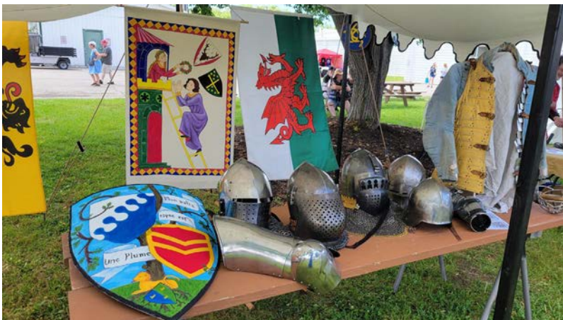
Display at the Ohio Scottish Games - demo hosted by Barony of the Cleftlands.

2-VI-104 The Oath of Fealty of the Order of the Mark shall be as follows: "I here swear fealty and do homage. To the Crown of the Middle Kingdom. To ever be a worthy Hunter of the Mark, Patient in pursuit, Measured in judgment, Obedient to my Liege Lord, A steadfast mis-sileer, Ever ready with bow, blade, or engine, Watchful of the realm's far borders, Thus swear I, (Name)." And the Crown shall answer: "This do We hear and will never forget, nor fail to reward that which is given: fealty with love, service with honor, and oath-breaking with vengeance."