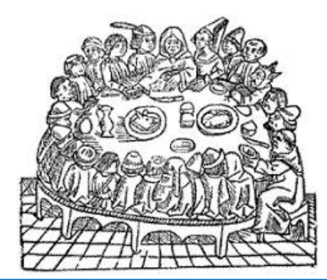
Silver Desert Agincourt September 6, 2025 Reno, Nevada

From Sacramento and northern Cynagua: Take your best route to CA-99 S. Continue from *.