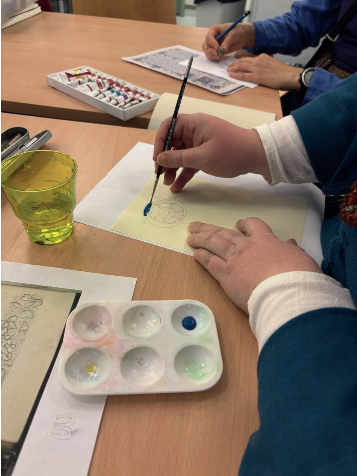
Artwork in progress

While in Gotvik the Kingdom University offered amazing chances to learn, to teach others and spread knowledge and not to forget about fun and merriment, Aarnimetsä hosted an unofficial event Kekri All-Hallows Eve. A tradition in this event is a contest of both combat arts and A&S. This year the contestants who signed up in pairs chose who of them would either do the combat side (heavy fighting, archery or fencing) and who chose the A&S task. The A&S assignment was to create an illuminated initial and then the populace would get to vote for their favourite. Here you can see the contestants doing the artwork and the final finished pieces. Some were donated to the Aarnimetsä Signet for further use. Thank you all who took part!