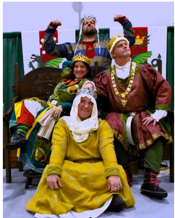
Our Royal Family - at Grand Day of Tournaments.