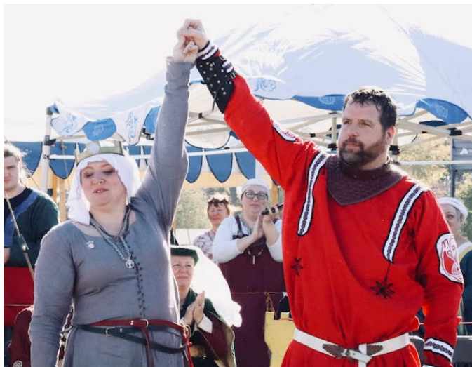
The moment of victory - at Fall Crown Tourney 2024. at her very first event! Keep a watch for her photos; this editor senses you'll be seeing more from her.