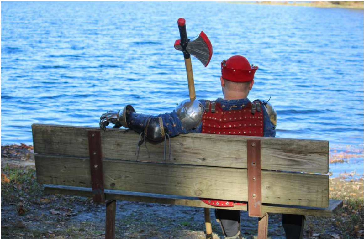
Thinking of the fight - at Rendezvous at the Bridge 2024.