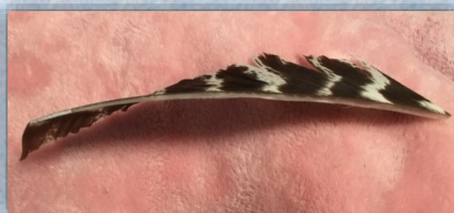
Photo 3: Closer view of base of full length fletching showing the curved rachis