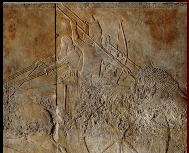
Stone wall panel; relief; the king has grabbed a spear from an attendant and drives it into wounded lion that is biting the wheel of the chariot; one attendant holds the royal bow, while another holds spear ready.

The Assyrian era, from 645 to 635 BCE, provides further insights into Arabian archery. Assyrian forces actively pursued Arab raiders during the reign of Ashurbanipal, the king of Assyria. Artifacts from this period show bows with curved tips but lacking the curve at the handle.