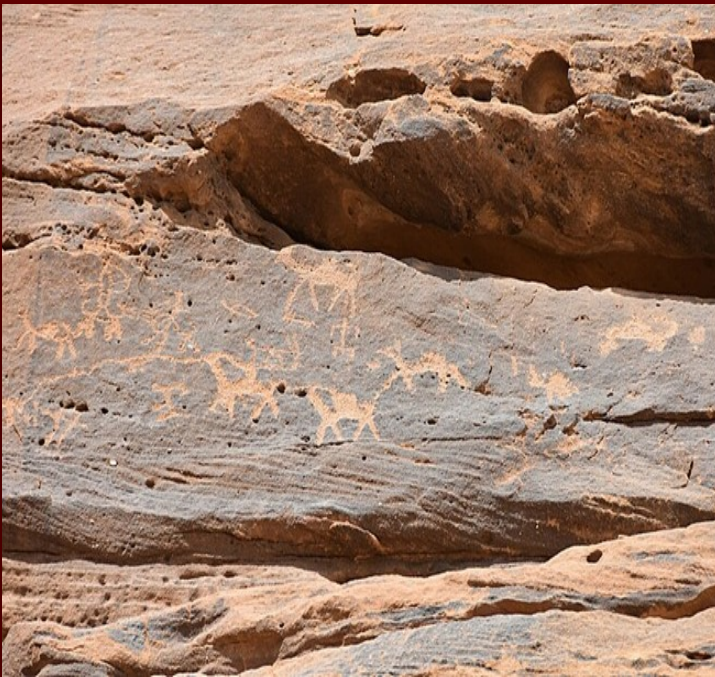
Jabal Ikma, ancient Arabian rock art and inscription site; 1st millennium BCE; al-Ula, Saudi Arabia (23)"

In this series, "Annals of Archery," we will delve into that history, paying close attention to how archery has benefited various people and civilizations. Let's start this series with a closer look at the Arabian Empire.