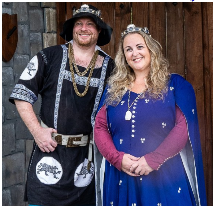
Prince Athos and Princess Alianora — 3 May 2025