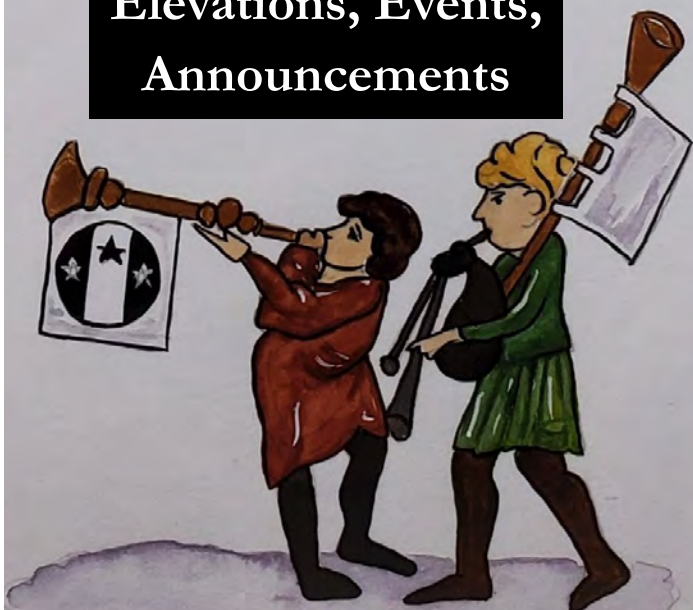
Illumination by Danielle Bird