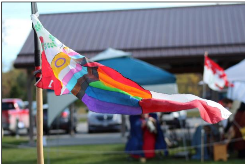
Epic Pride Flag at Crown.

The Pursuivant responsible for developing and supporting DEIB and accessibility for the Ealdormere College of Heraldry. This French title is a motto in origin, meaning "open road" or "right path". There is a Plein Chemin Herald historically; "he served Louis de Bourbon, Admiral of France, according to Froissart."