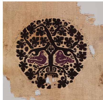
(ABOVE) ORBICULUS (ROUNDEL) – A TUNIC DECORATION OF A GRAPEVINE WITH TWO PURPLE BIRDS EMERGING FROM A POT, EGYPT, 5TH-7TH C. CE MET MUSEUM (NY)