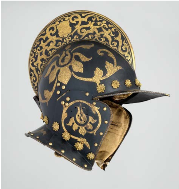
(LEFT) BURGONET LINED WITH YELLOW SILK, GERMANY, 1575-1600 CE MET MUSEUM (NY)