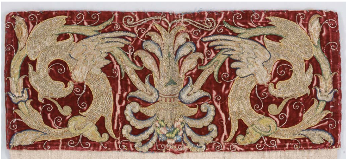
FANTASTICAL BIRDS AGAINST A RED GROUND, ITALIAN OR SPANISH, 16TH C. CE MET MUSEUM (NY)