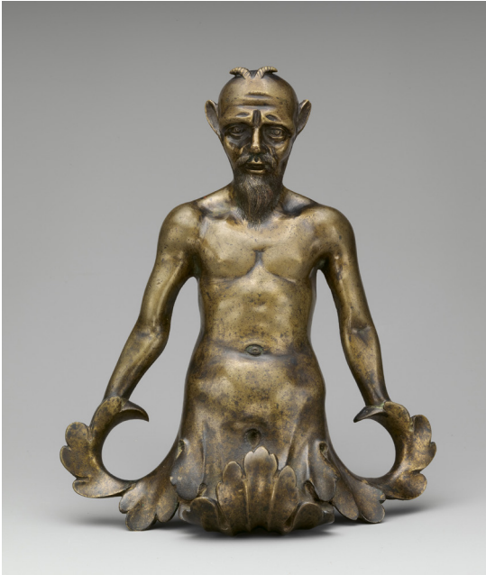
BRASS KNOCKER, 1560-1570 CE, GERMANY (LEFT)