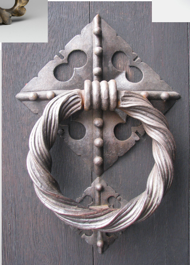
DOOR KNOCKER, 15TH-16TH C. CE, EUROPE