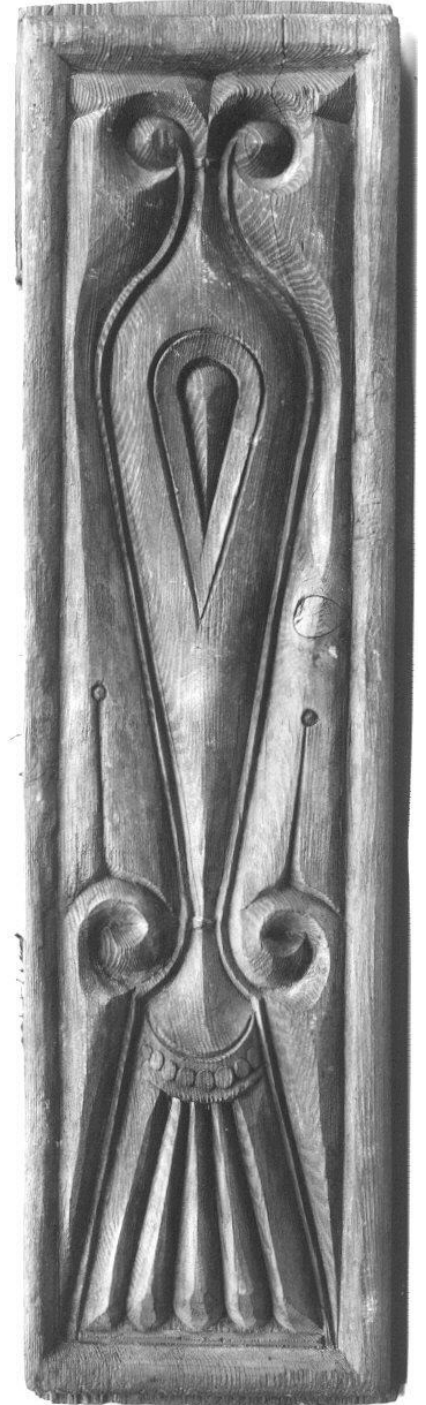
DOOR PANEL WITH A BEVELED DESIGN, 9TH C. CE, EGYPT