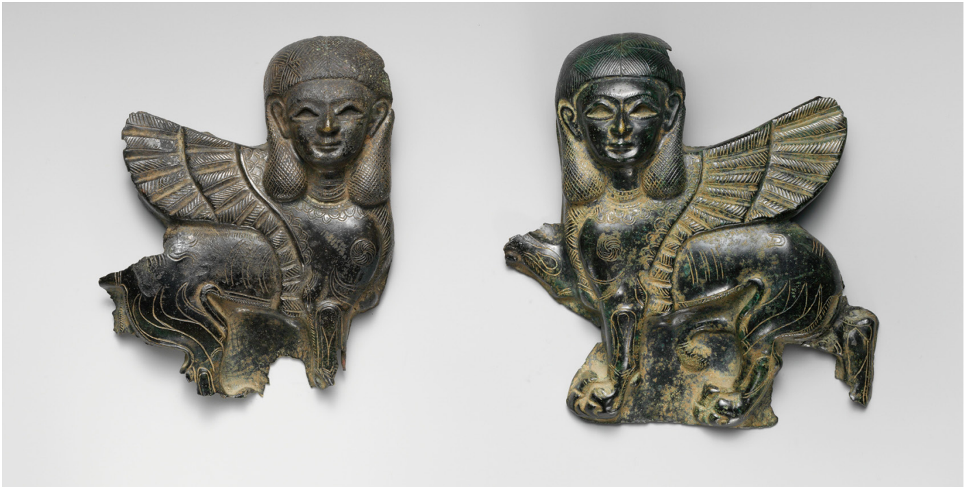
PLAQUE IN THE FORM OF A SPHINX, c 8TH C. BCE, SYRIA