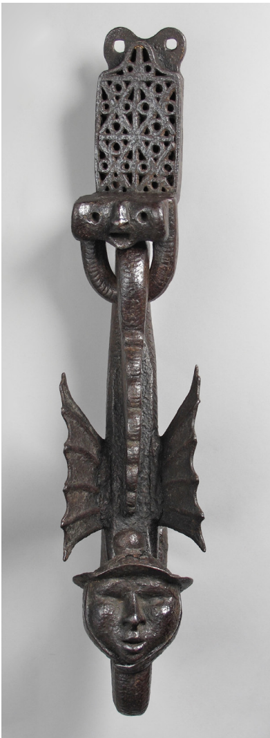
FIGURAL KNOCKER, 15TH-16TH C. CE, EUROPE