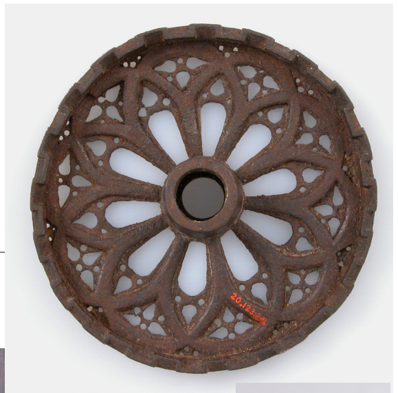
IRON KNOCKER, LATE 16TH C. CE, SPAIN (RIGHT)