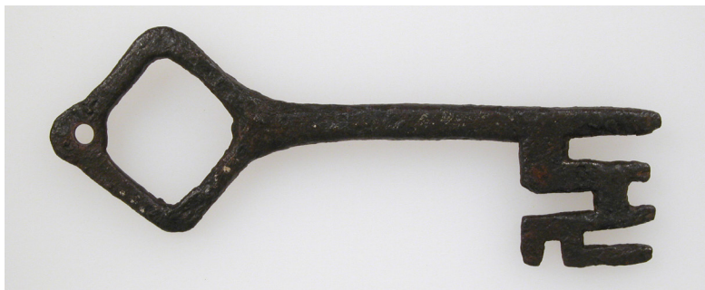
IRON KEY, 13TH C. CE, GERMANY