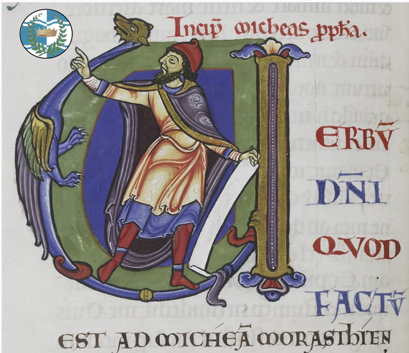
The Bury Bible f. 328v, MS 002III

Newsletter for the Kingdom of Atlantia SCA, Inc.