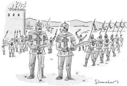
"I've never actually stormed a castle, but I've taken a bunch of siege-management courses."