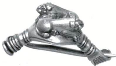
FIBULA, IRAN, CA. 7TH C. BCE (LEFT)

Has laughter, lightly lifting loves massage Become the strand, or does within her lodge A purer form that flirting, flings to me? Is love the bridge that binds my soul to thee?