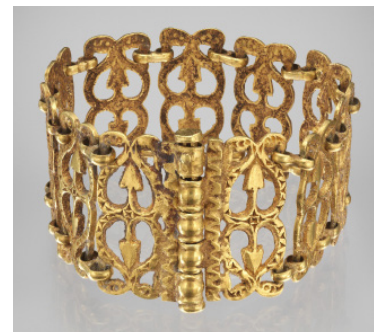
GOLD BRACELET, BYZANTIUM, CA. 650 CE