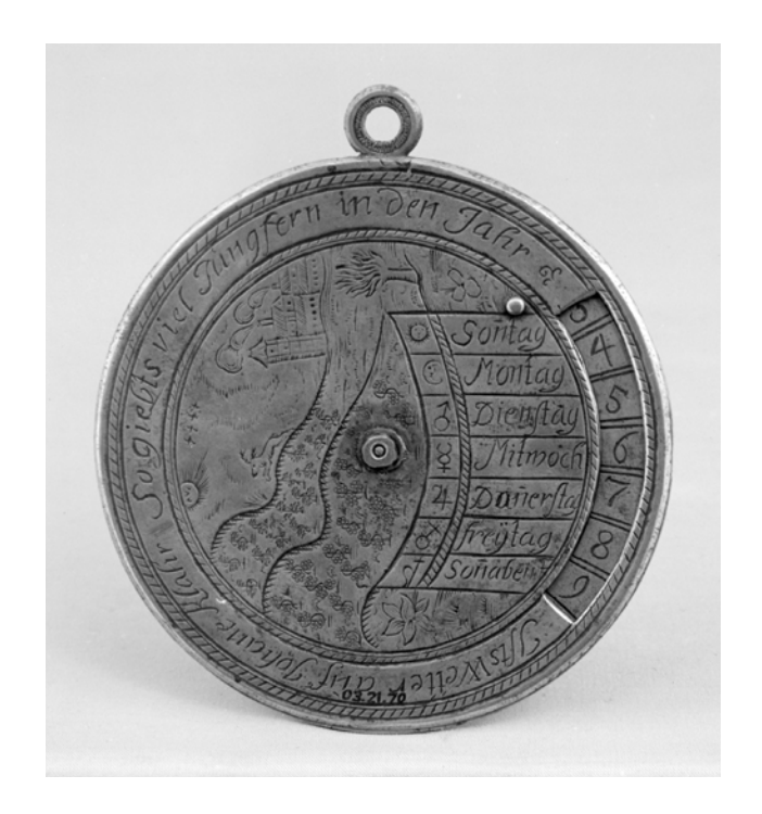
Perpetual Calendar, Germany, 16th c. CE MET MUSEUM (NY)

https://northshield.org/Events/EventAd.aspx?ID=4735