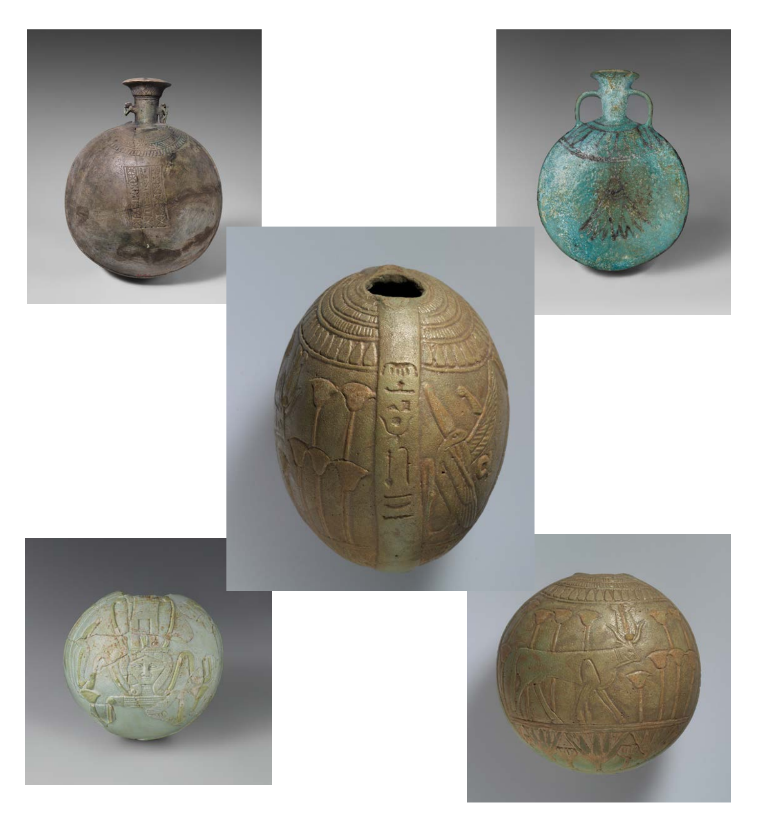
Lentoid Bottles, Egypt, ca. 664-332 BCE

A collection of Lentoid "New Year's Bottles" from Egypt's Saite Dynasty. Frequent decorative motifs include the cow goddesses Nebethetep and Hathor, falcon god Horus, lotus flowers and marshes. These flasks, inscribed with good luck wishes, were filled with Nile water and given as New Year's gifts.