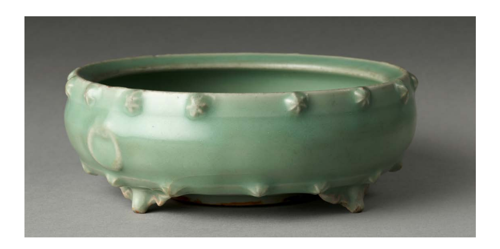
Container to grow Narcissus Bulbs to celebrate the New Year, China, 13th-early 14th c. CE Met Museum (NY)