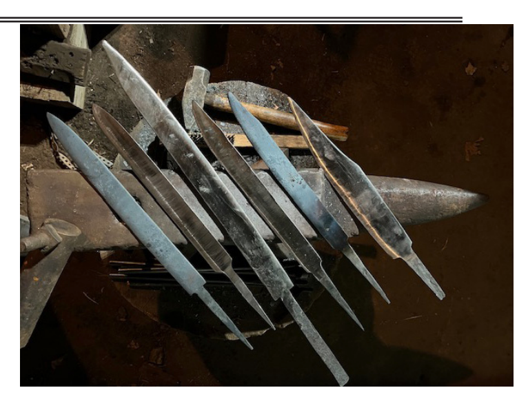
The Northwatch – April 2023

Blades on an Anvil