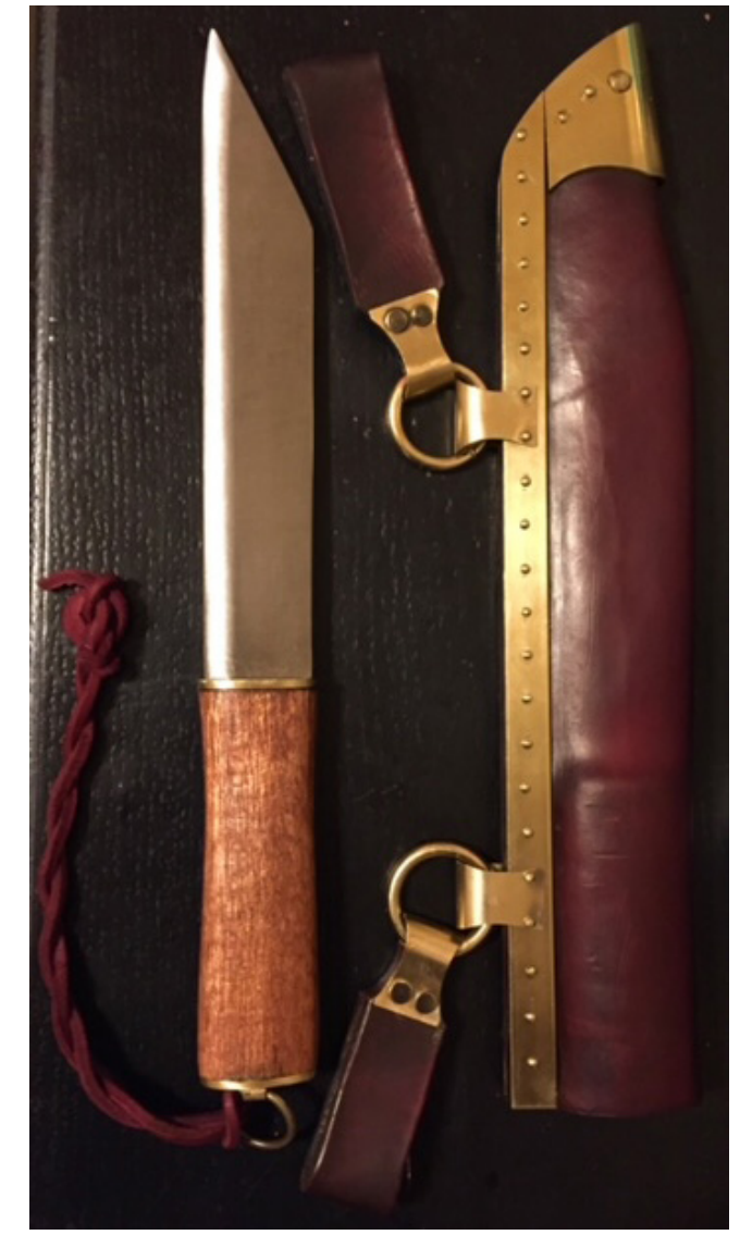
Seax and Sheath