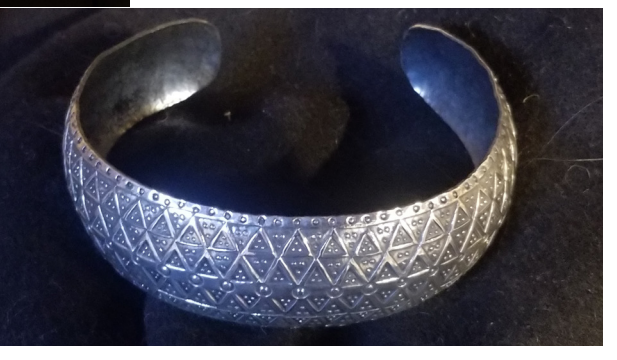
The Northwatch – April 2023

SIX-STRAND TWIST (left), Stamped Cuff (right)