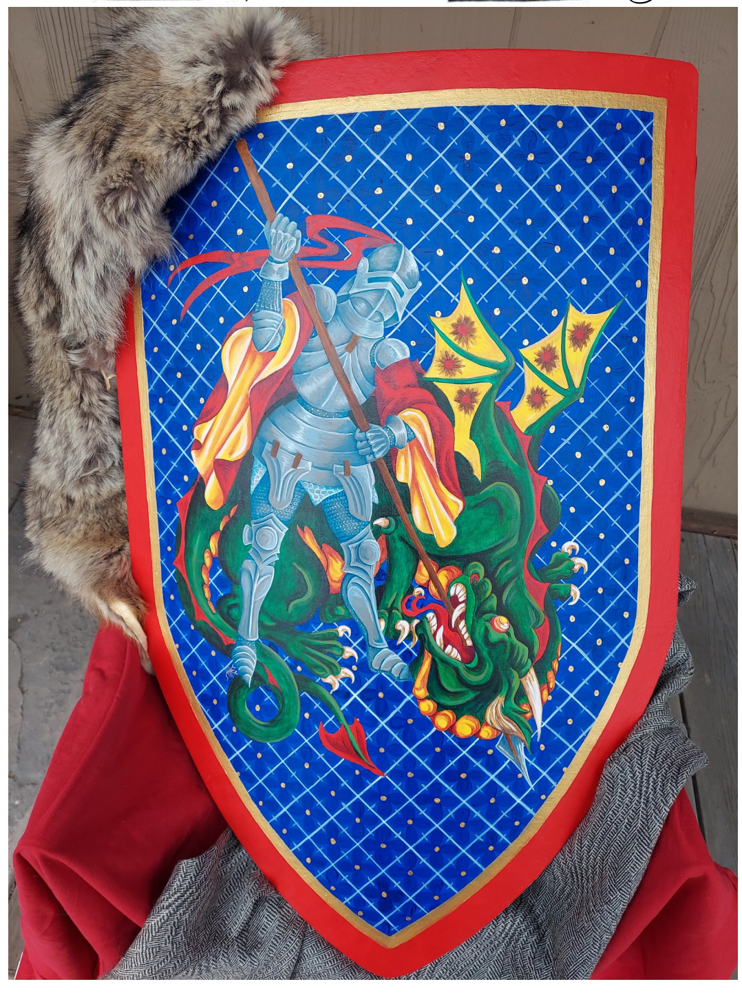
Newsletter for the Kingdom of the West April 2023 A.S. LVII